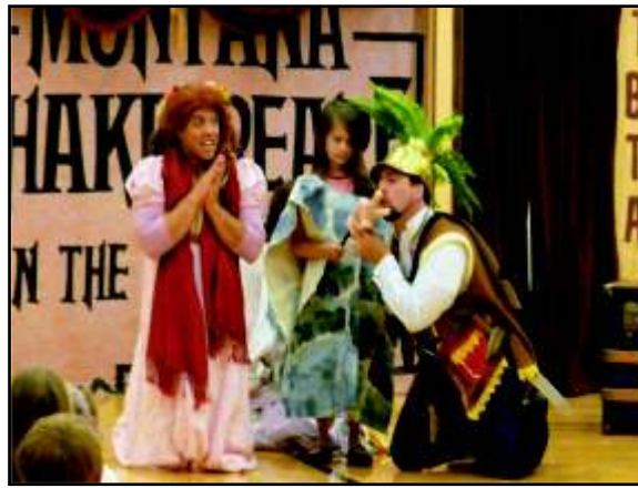
A young student plays a part in All's The West's A Stage: A Midsummer Night's Dream at Ridge View Elementary in Belgrade, Montana.

~ Fourth grade teacher - Lewistown, Montana